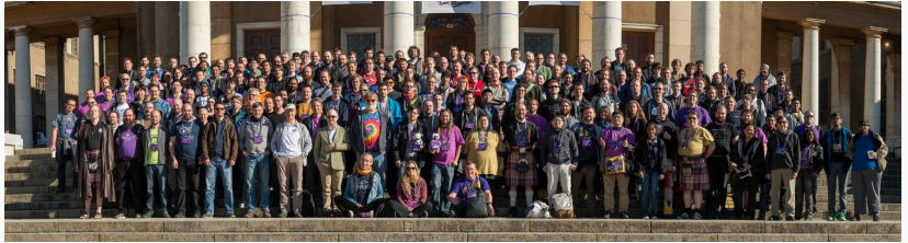
DebConf16 Group Photo

A gathering of Debian users, developers, bug reporters, supporters, companies to discuss on, hack on, and cheer on Debian!