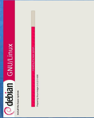
Debian 6 comes with a Linux 2.6.32 kernel